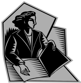
A sample picture offered by Microsoft Office

Submit entries by March 25th to : wjgroundruledouble@gmail.com